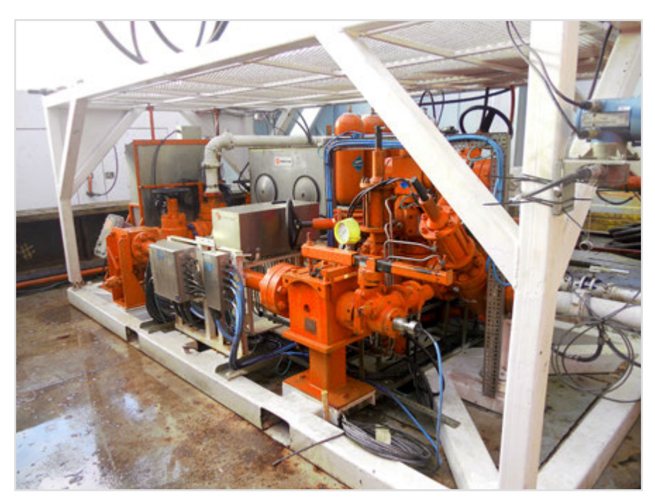
Figure 4: @balance Services DAPC choke manifold

Drilling engineering services by @balance Services provided a complete MPD drilling program and assistance in addressing the requirements of NTL 2008-G07 as required for MPD wells in the Gulf of Mexico. These services included hydraulics modeling, hazard identification and operability (HAZID/HZOP) workshops, and wellsite training to assure the competency of involved personnel.