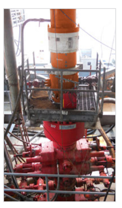
Figure 5: HOLD RCD on top of annular preventer