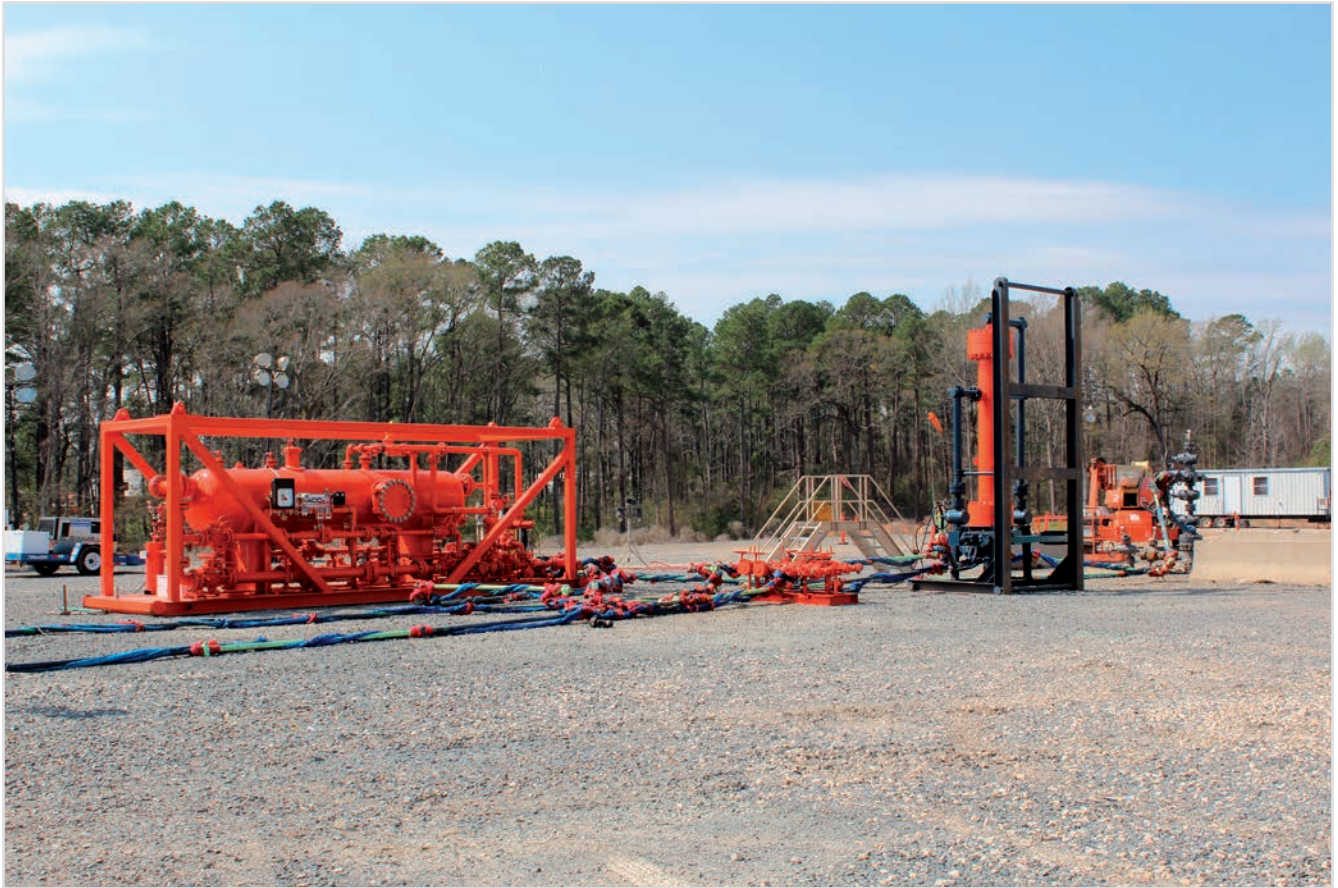
3-Phase Separator on location