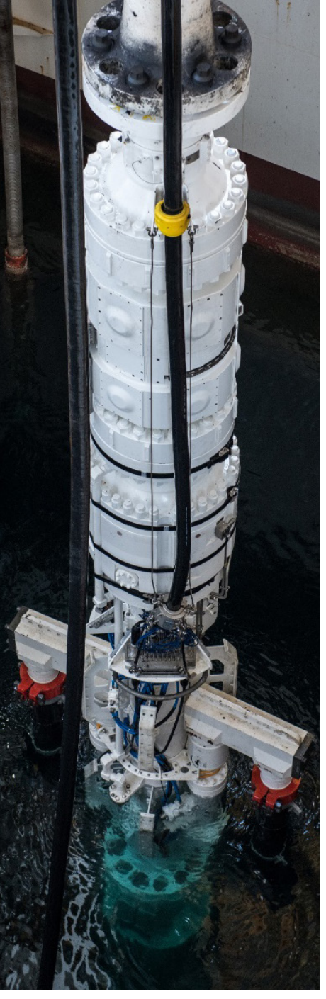
Below tension ring rotating control device.